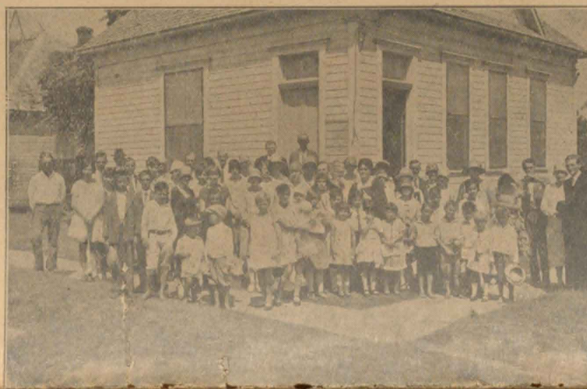
Congregation of The Worth Temple is elated over the prospects of becoming Foursquare Lighthouse, and having a big new tabernacle church to worship in, seating 2,000 or more people. This is picture of our Sunday School when 60 days old. We have grown so rapidly that we must have larger quarters in order to take care of our rapidly growing crowds.