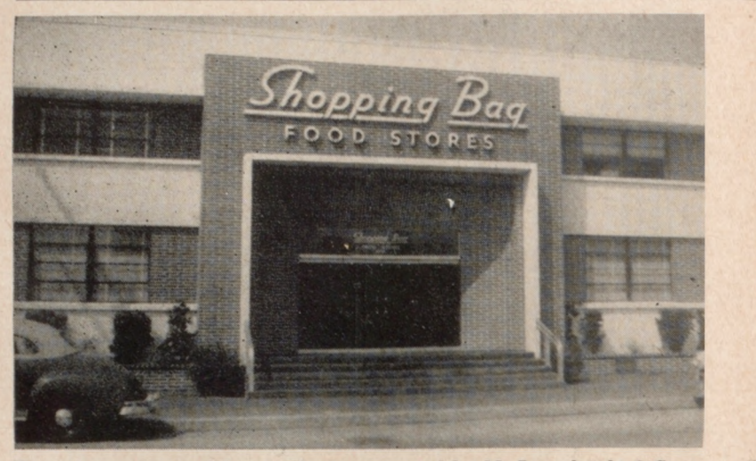
The entrance to an elaborate plant constructed by M. Arganbright & Sons.