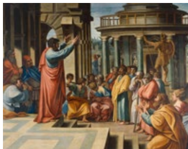
Paul in the Areopagus 19

For instance, when Paul is in Athens, he preaches to the philosophers at the Areopagus. Rather than using deceptive or coercive rhetoric, he “reasoned in the synagogue with the Jews and the devout persons, and in the marketplace every day with those who happened to be there” (Acts 17:17).