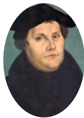
Martin Luther 12

The interpretation of the parable in favor of religious liberty also received clear expression in Martin Luther's early works. In 1525 he wrote, "As to how we should treat heretics and false teachers, we ought not to eradicate and exterminate them. Christ says openly here that they should be left to grow together." 11 Luther noted with characteristic vigor that true religious liberty required tolerance of even the most grievous theological error. This is because persecuting the heterodox usurped authority that belonged within the exclusive purview of God.