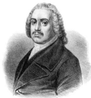
Roger Williams 31

It is clear that the Bible’s vision for a flourishing society is one in which the government recognizes a broad understanding of religious liberty. When the state acknowledges its limited authority and understands that there are areas in which it is not competent—such as religion—the church is able to freely carry out its mission. While it is true the church will advance with or without religious liberty (Matt 16:18), it is equally true that persecution makes the dissemination of the gospel much more difficult. This is why Christians throughout history who have found themselves persecuted for their faith have sought to persuade the civil authorities to grant them freedom in matters of religion and conscience.