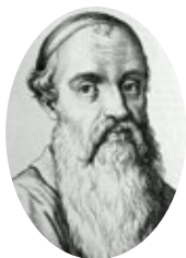
Menno Simons 16

This is the interpretation embraced by the Anabaptists, a group that arose in the 1520s known primarily for their practice of credobaptism (adult baptism after profession of faith). In their advocacy for religious liberty, the Anabaptists anchored their appeal in the parable of the tares. Menno Simons (1496-1561) is a notable example. Simons joined the Anabaptists