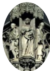
Wazo of Liège 10 (right)

A few centuries later, Wazo of Liège (985-1048) considered the parable and asked, “What does our Lord indicate by these words if not the patience which he desires preachers to show to their erring neighbors, especially since those who are tares today may be wheat tomorrow.” 9 In other words, tolerance should be extended to heretics because they still have a chance to be saved. After all, God is merciful and gives all an opportunity to repent.