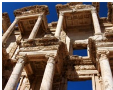
Library of Celsus, Ephesus

In Acts 19, Paul travels to Ephesus on his second missionary trip. The language Luke uses to describe Paul's interaction with the Ephesians provides another glimpse into how the apostle approached the task of evangelism and what he believed was necessary for someone to be saved.