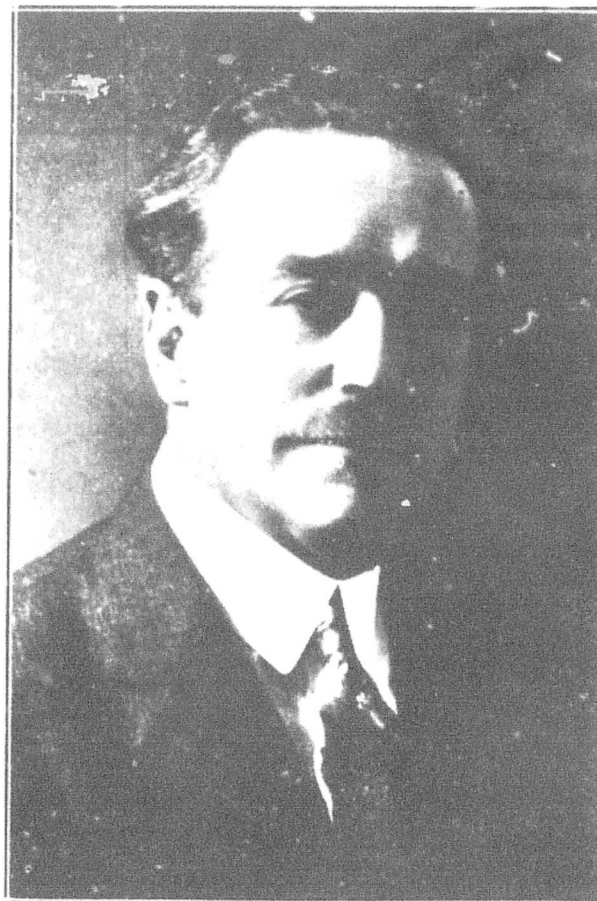
EVANGELIST CHARLES F. PARHAM Original Preacher and Teacher of all Full Gospel Movement

All day Sundays with Basket Dinners Jan. 2nd.