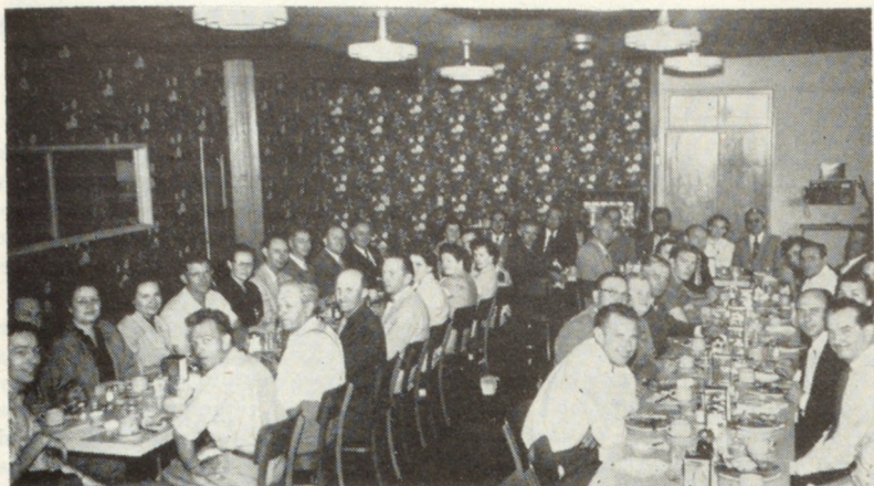
This photo was taken at the inauguration of another Chapter of Full Gospel Business Men's Fellowship international on July 18th at Lancaster, Calif.