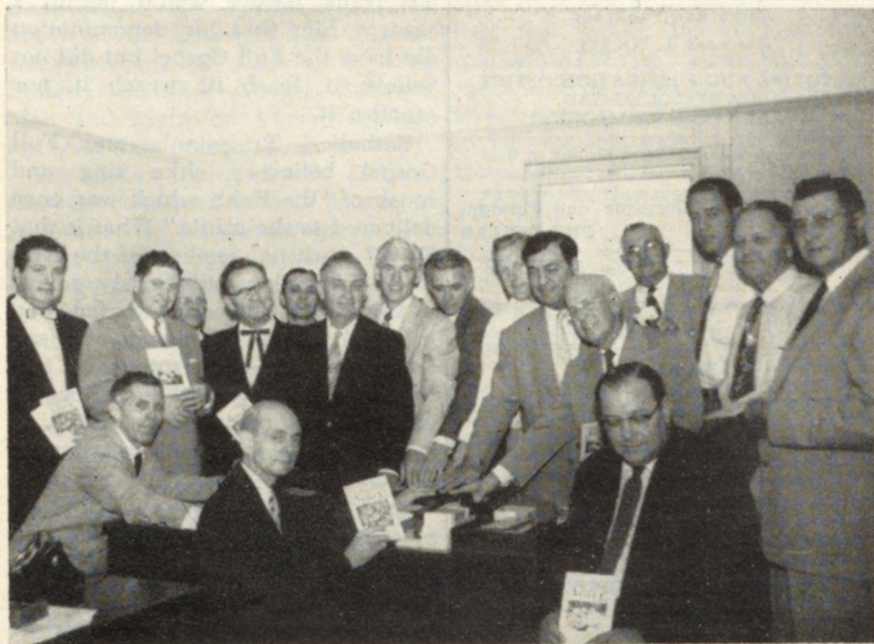
Dedication of the Los Angeles Office of Full Gospel Business Men's Fellowship International July 11th. Identification at the bottom of Page Three.