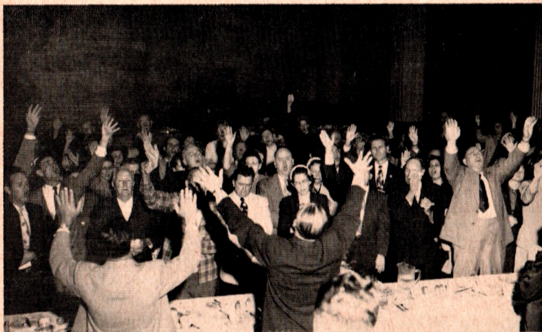
This photo was taken at the San Francisco Breakfast-Broadcast of the Western States Convention. God did a lasting work in the hearts and lives of everyone present. Men and women alike wept before God until their handkerchiefs could hold no more tears. Soon after the Catholic photographer made this shot, he put his camera down, raised his hands and cried out to God as tears streamed down his face.

The Convention was sponsored by the Golden Gate Pentecostal