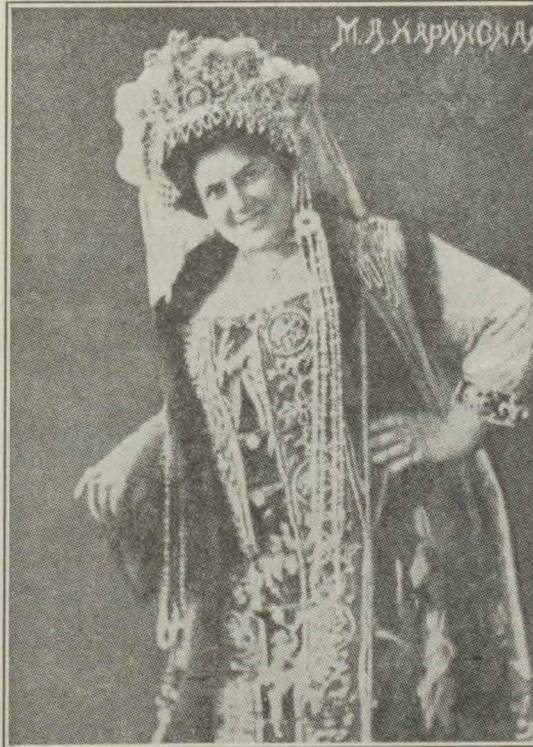
DAME MARIA KARINSKA

In national costume of 17th century Russian Royalty. Picture taken in Moscow 1916.