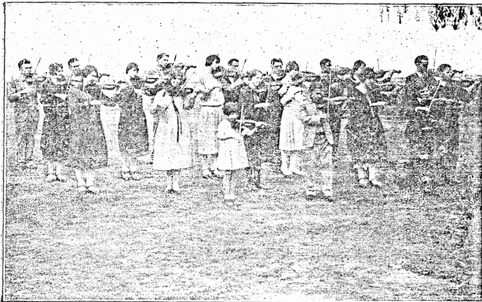
The large Violin Class at Kings College