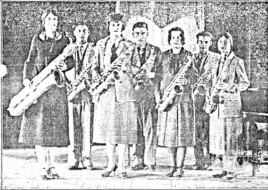
Saxophone Players at Kings College