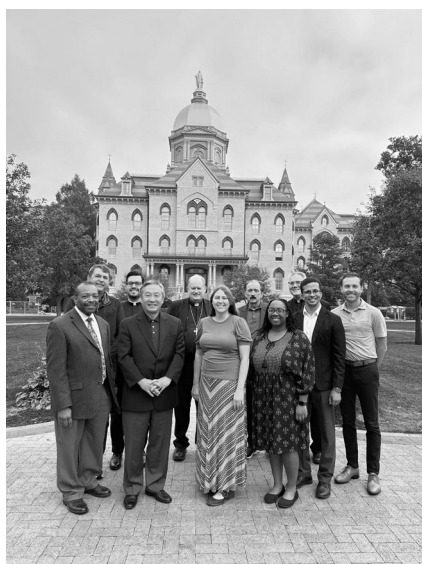
Dialogue Participants, University of Notre Dame, 2023